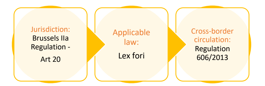
Figure 4: Pathway 4

Where there are matrimonial proceedings pending between the abducting mother and the left-behind father in the State of refuge, Article 20 of the Brussels IIa Regulation gives jurisdiction to the courts of the State of refuge to take provisional protective measures, based on the presence of the abducting mother on the territory of that Member State. However, as mentioned in respect of Pathway 1 (see above), protective measures taken under Article 20 are not enforceable outside of the territory of the Member State where they were taken.<sup>52</sup> Nevertheless, on a functional construction of Regulation 606/2013, this Guide envisages the possibility that protective measures are circulated under that Regulation (see Pathway 1 above and Figure 13 below).