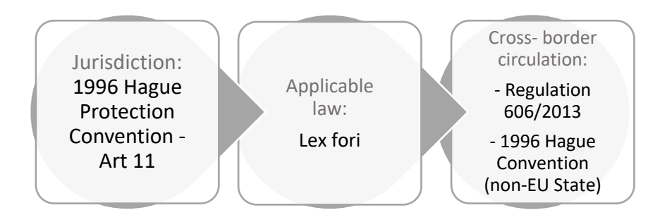
Figure 3: Pathway 3

residence is a non-EU Member State (e.g. the United Kingdom). In such case, circulation of the measures would be facilitated by the 1996 Hague Convention. (Figure 12 below).