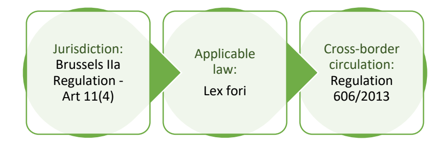
Figure 2: Pathway 2

Article 11(4) can be used also as a jurisdictional ground for measures to protect the mother in return proceedings involving allegations of domestic violence. On a functional construction of Regulation 606/2013, this Guide envisages the possibility that such protective measures are then circulated under Regulation 606/2013 (see above and Figure 11 below).